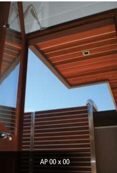
AP 00 x 00