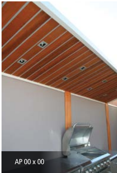
AP 00 x 00