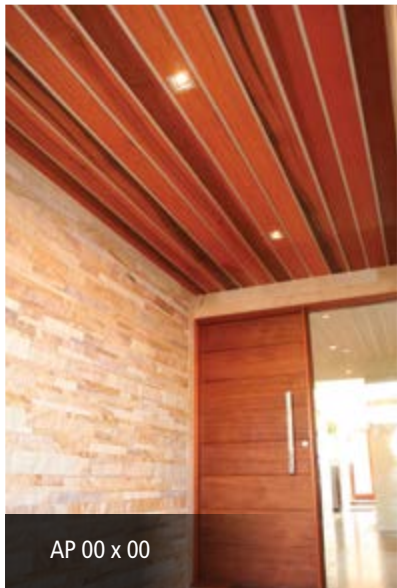
AP 00 x 00