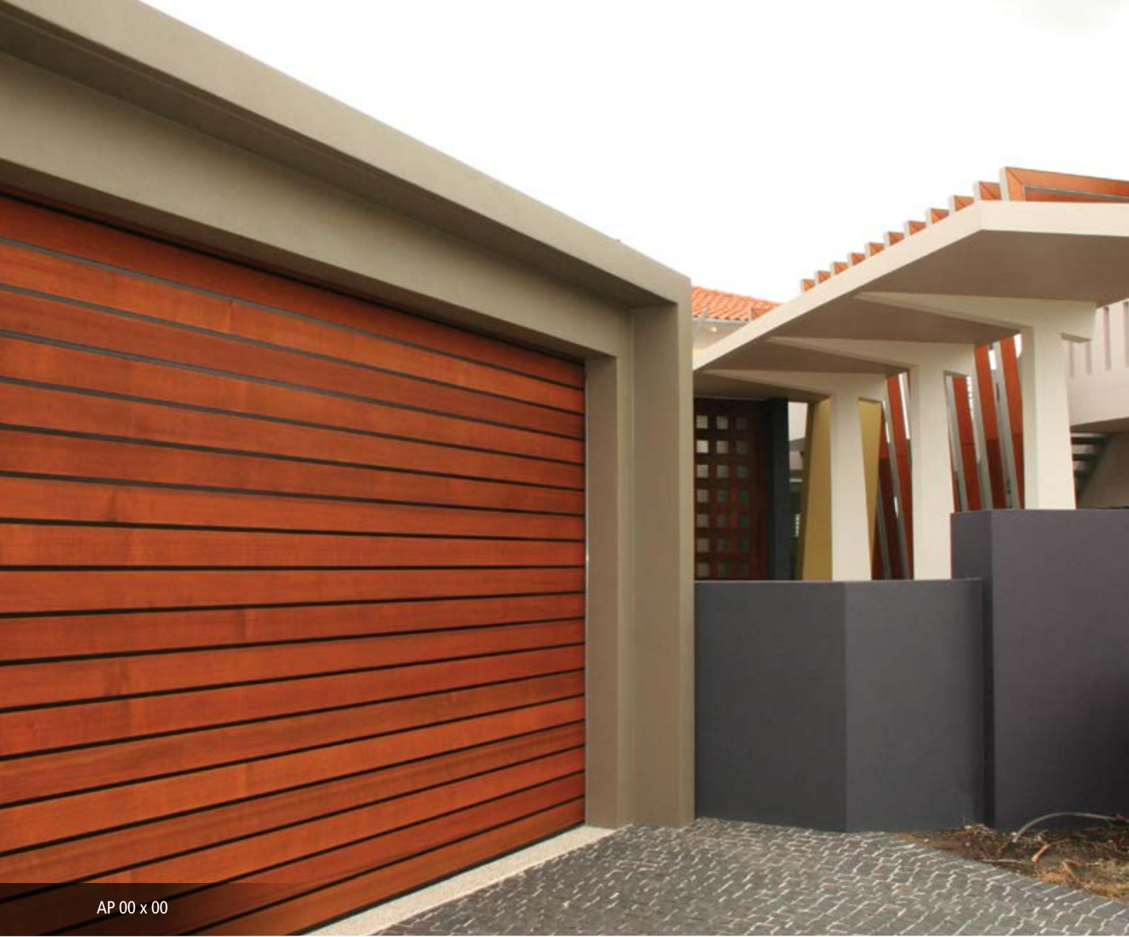
AP 00 x 00