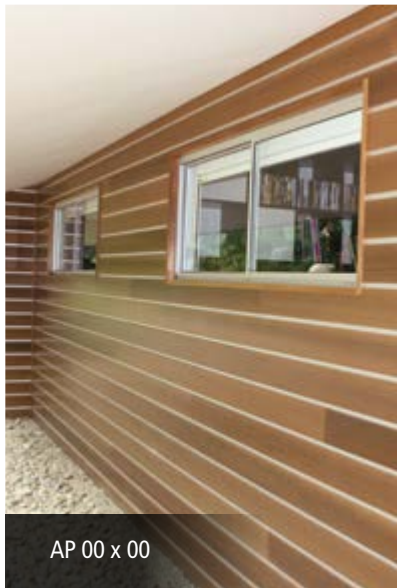
AP 00 x 00