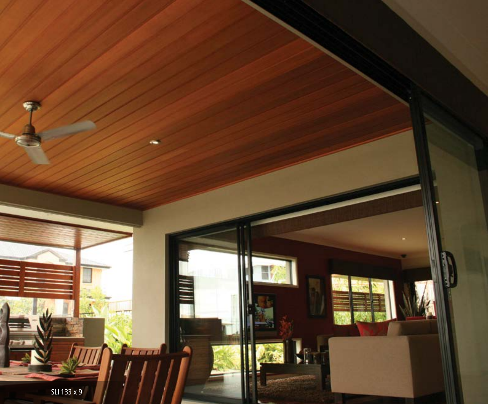
SLI 133 x 9