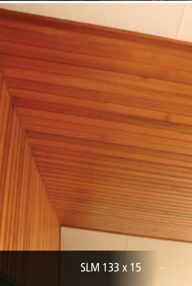
SLM 133 x 15