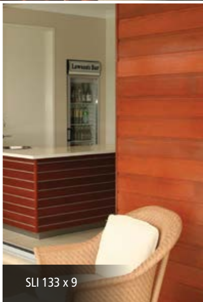
SLI 133 x 9