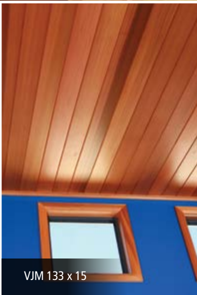
VJM 133 x 15