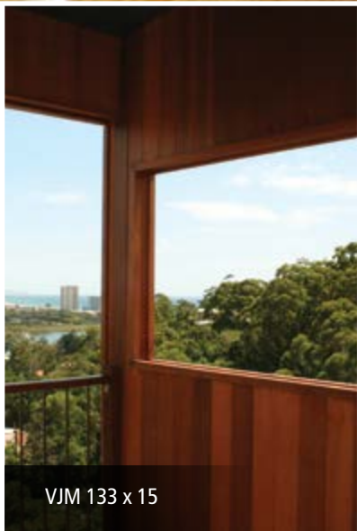
VJM 133 x 15