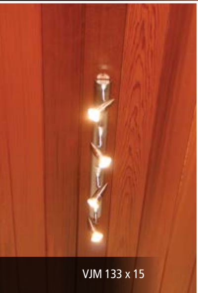
VJM 133 x 15