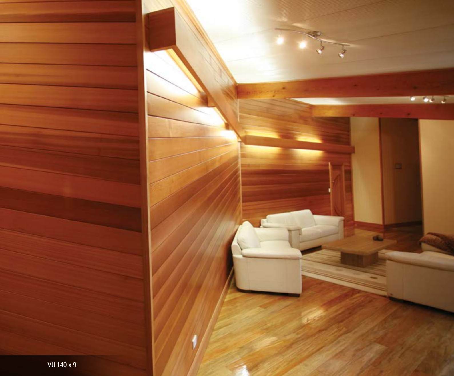
VJI 140 x 9