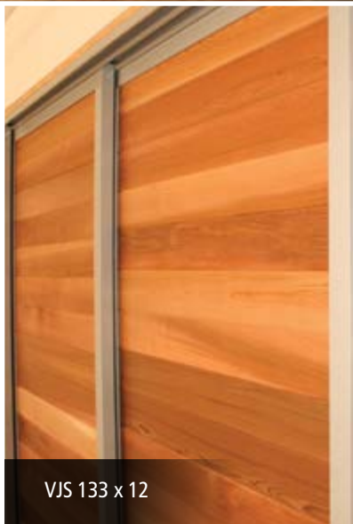
VJS 133 x 12