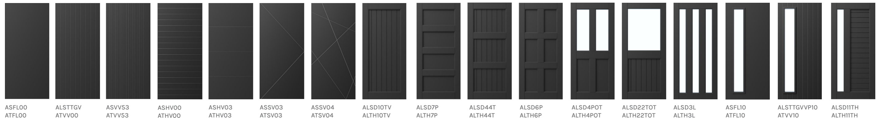
ASFL00 ATFL00 ALSTTG V ATV00 ASVV53 ATVV53 ASHV00 ATHV00 ASHV03 ATHV03 ASSV03 ATSV03 ASSV04 ATSV04 ALSD10TV ALTH10TV ALSD7P ALTH7P ALSD44T ALTH44T ALSD6P ALTH6P ALSD4POT ALTH4POT ALSD22TOT ALTH22TOT ALSD3L ALTH3L ASFL10 ATFL10 ALSTTGVP10 ATV10 ALSD11TH ALTH11TH

SCAN THE QR CODE TO LEARN MORE AND EXPLORE OUR RANGE