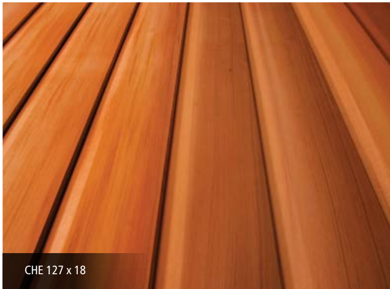
CHE 127 x 18