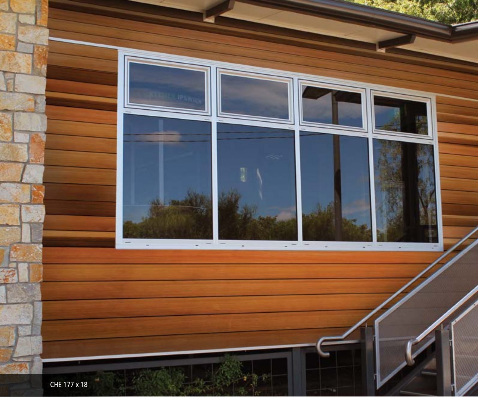
CHE 177 x 18