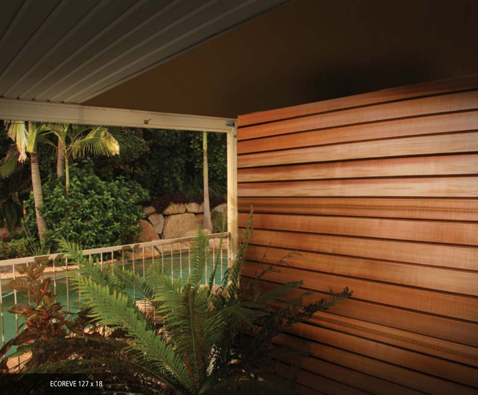
ECOREVE 127 x 18