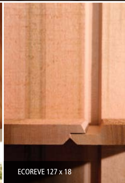
ECOREVE 127 x 18