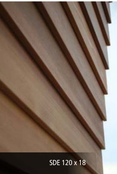
SDE 120 x 18