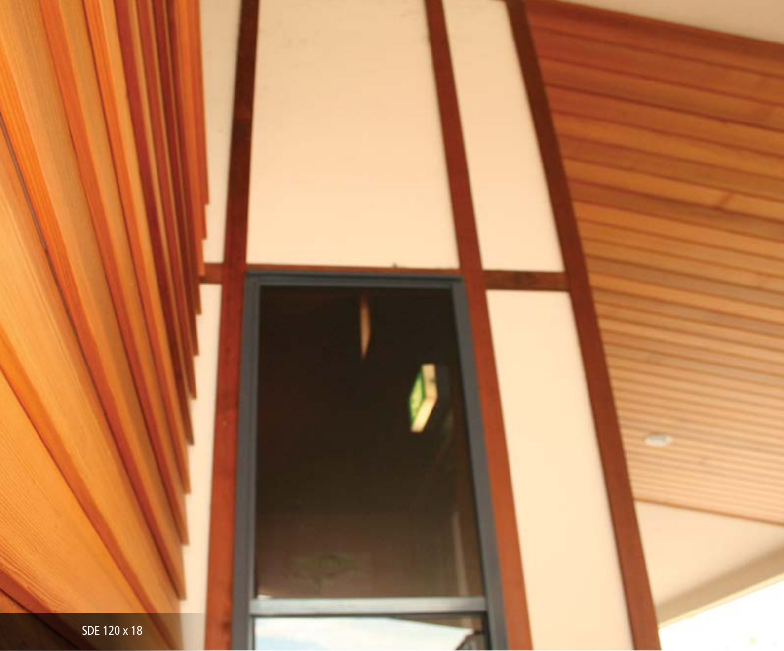
SDE 120 x 18