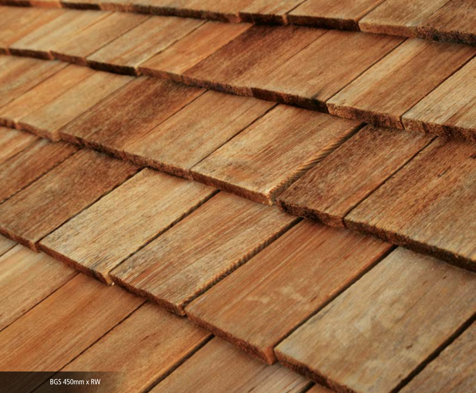
BGS 450mm x RW