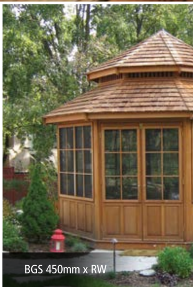
BGS 450mm x RW