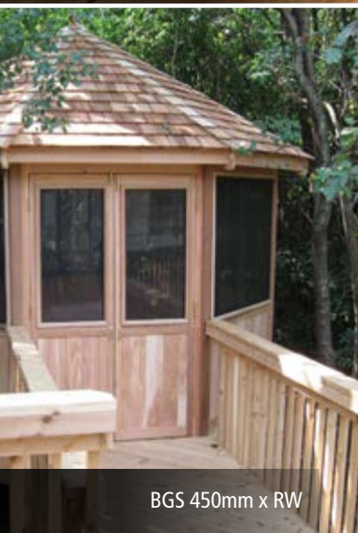
BGS 450mm x RW