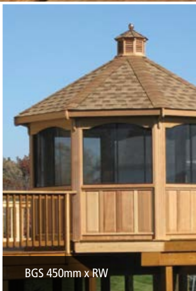
BGS 450mm x RW