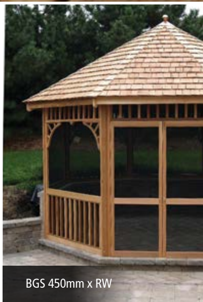
BGS 450mm x RW